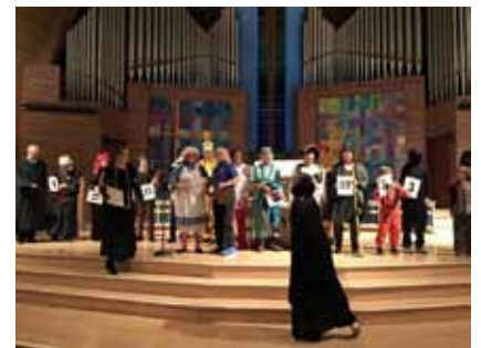
Halloween Fancy Dress Competition