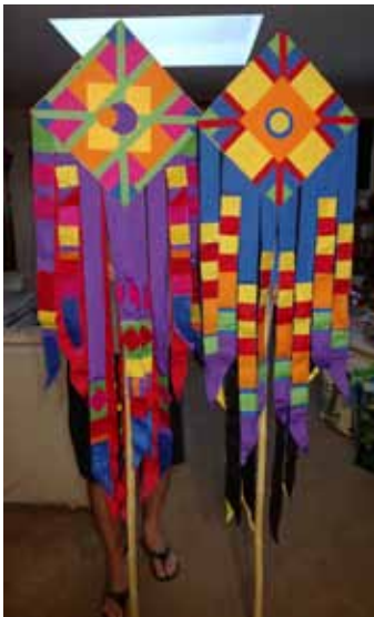
Ojos made by inmates from Elmwood Correctional Facility - displayed in October Worship Service featuring Art & Spirit Ministry, through CIC Ministries