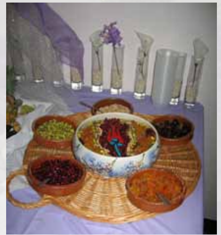
The winning pudding