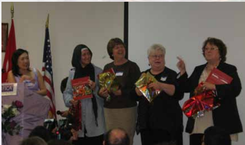
The winning group - California Zing